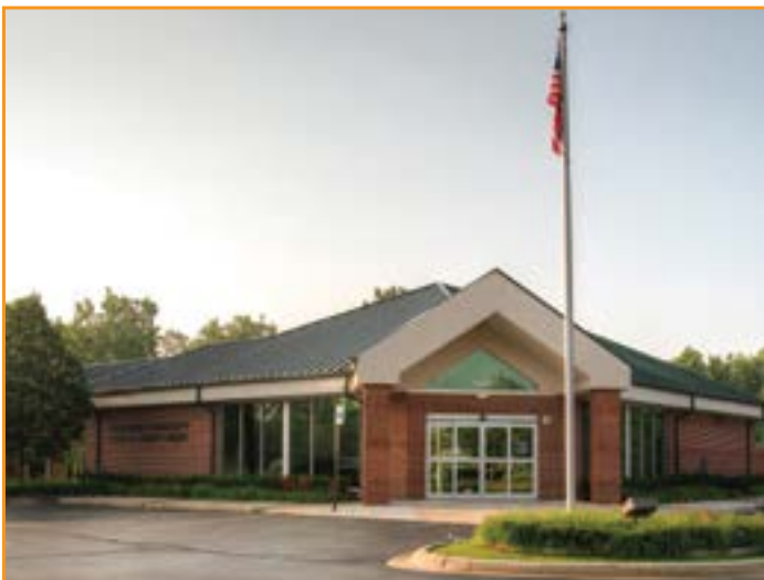
Downriver CU's Woodhaven Office