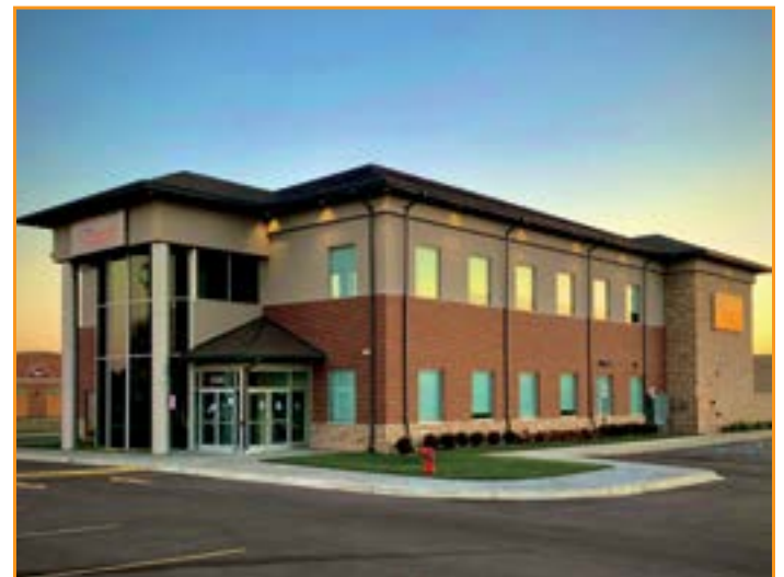
Downriver CU's Southgate Office